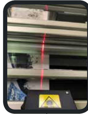
Laser ray for vertical cut (optional)