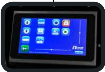
LCD Touch Screen Display