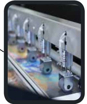
Pneumatic Pinch Roll