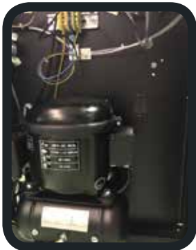
Silent compressor inside the machine