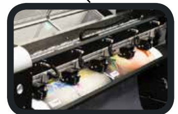
Double central cutting units (optional)