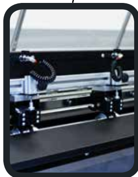
Pneumatic vertical cutting units