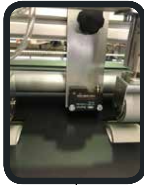
Sensor to read cross-marks